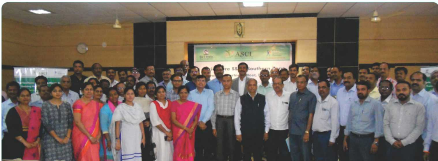
Southern Zone Training Partners' Meet at Bengaluru

ASCI organized Training Partner's Meet in June 2018 at Institution of Agricultural Technologist, Bengaluru where in 62 TPs participated. The agenda was mainly to address key points such as latest developments in skilling in Agriculture domain; to elicit feedback from Training Partners regarding skilling; to address the issues facing by TPs in implementation of PMKVY & Non PMKVY Program, to discuss current projects and opportunities for TPs under other Ministries/ Programmes/ States/ University System and to discuss about Way Forward in association with ASCI and skilling eco system