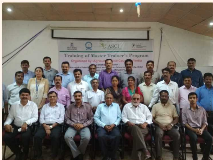
ToT at MPUAT, Udaipur