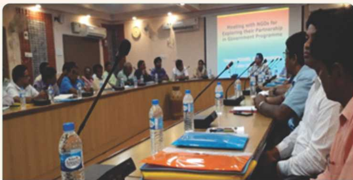
Skill Development Meeting at Bhubaneswar