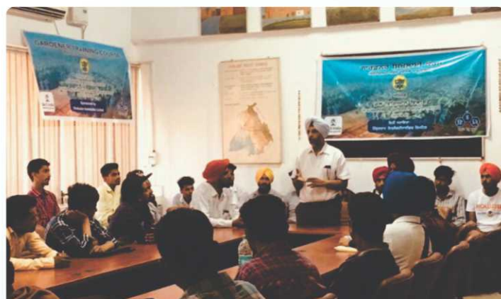
Training at Punjab

To begin with, training has been started in Gardener job role at ASCI affiliated State Agriculture Universities such as Narendra Deva University of Agriculture and Technology (NDUAT), Faizabad and Punjab Agriculture University (PAU), Ludhiana.