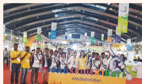
Candidates at Southern Regional Competition