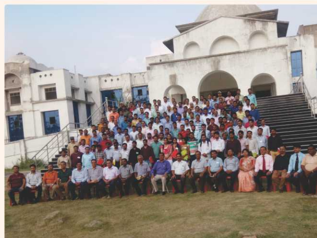
ToT at BAU Sabour