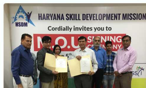
MoU signing between ASCI & HSDM