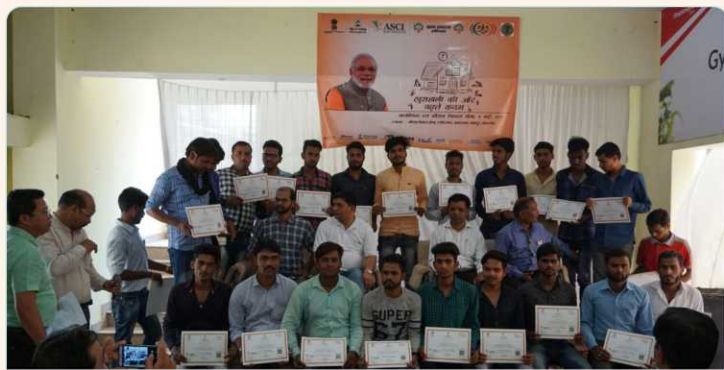
Rozgar Mela at Jabalpur