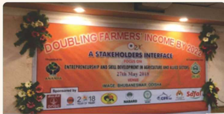
Meeting for Fisheries RPL at Bhubaneswar