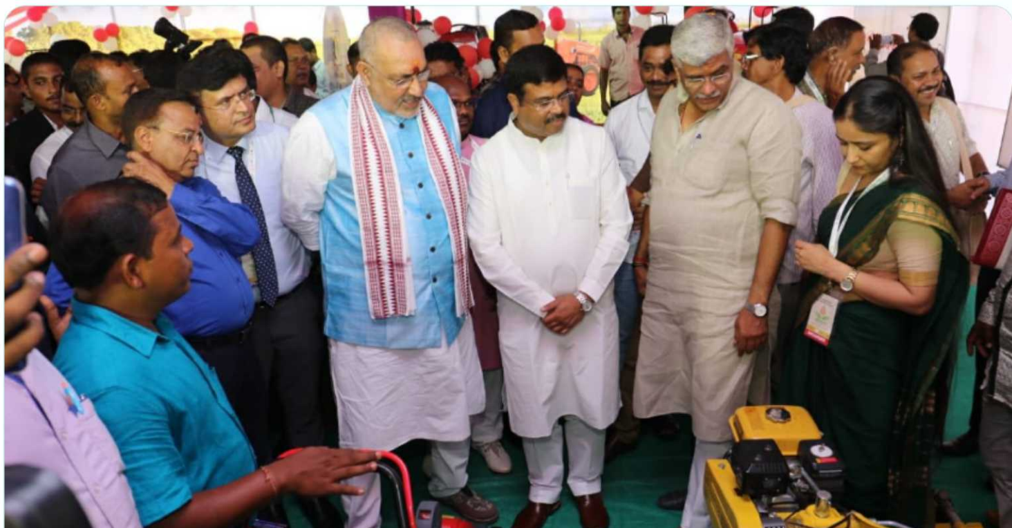
Shri Dharmendra Pradhan, Hon'ble Minister, MSDE inaugurated ASCI's Farm Mechanization skill pavilion

ASCI participated in AgriVikas 2018 held at Shiksha 'O' Anusandhan University, Bhubaneswar, Odisha from 29 th -30 th Jun'18. ASCI's Farm Mechanization skill pavilion was inaugurated by Shri Dharmendra Pradhan, Hon'ble Minister, MSDE, Shri Giriraj Singh, MoS, MSME and Shri Gajendra Singh Shekhawat, MoS, MoA&FW. ASCI actively participated in this event by promoting Skilling in the Farm Mechanization.