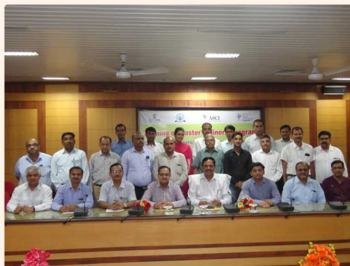
ToT at CoF, Mangalore