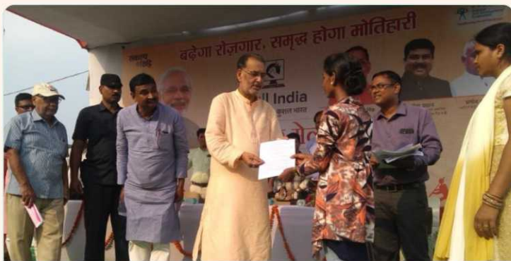
Rozgar Mela at Motihari