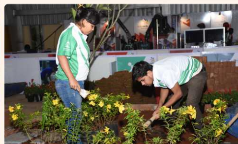
Competition at Bengaluru