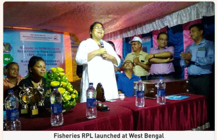
Fisheries RPL launched at West Bengal