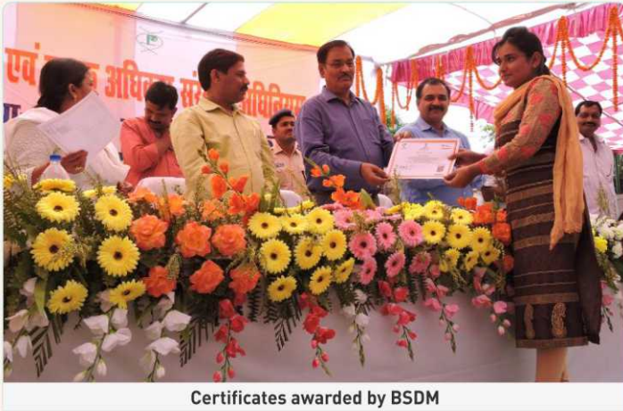
Certificates awarded by BSDM