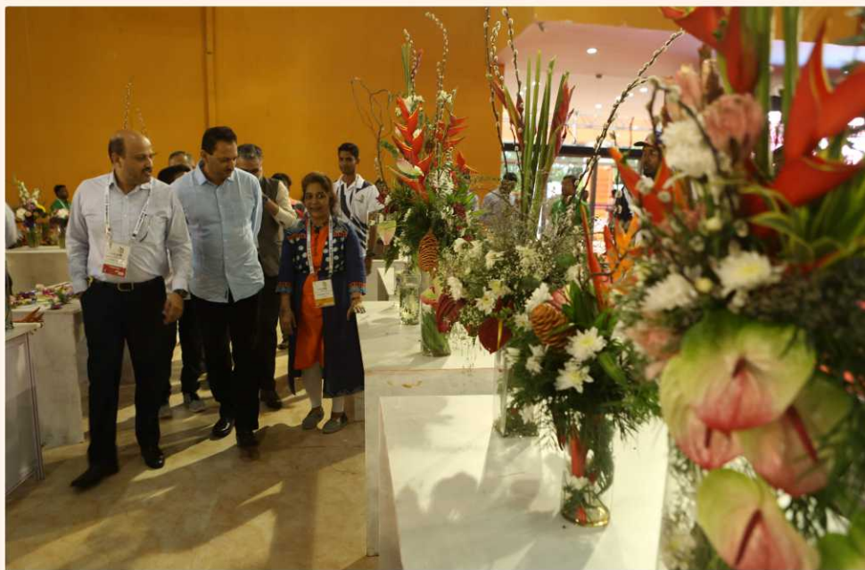
Mr. Anant Kumar Hegde, Hon'ble MoS, MSDE graced the Floristry competition space at Bengaluru

On last day, Mr. Anant Kumar Hegde, Hon'ble Minister of State, MSDE graced the Floristry competition space and appreciated the art work prepared by candidates.