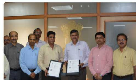
MoU signing between ASCI & NSFDC