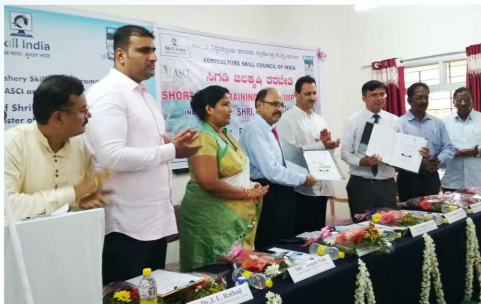
ASCI MoU signing with KUD in presence of Shri Anant Kumar Hegde, Hon'ble MoS, MSDE